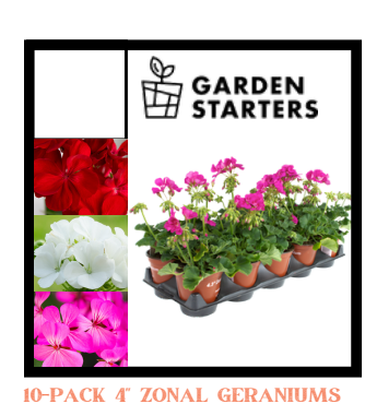
Open the door to a garden of endless possibilities! These easy-to-grow bedding plants available in red, white, or pink, stay resilient against pesky intruders like deer & rabbits. Get ready for a burst of color!