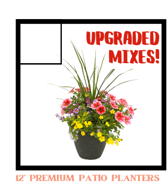
See what's new! Our upgraded Outdoor Patio Planters feature a blend of our top-performing plant collections, all set to thrive in full sun. They're your ticket to springtime paradise right in your very own backyard!