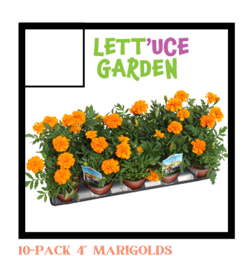
Experience a season-long visual treat! Our orange Marigolds promise more than just a pop of color - they also compliment various veggies. It doesn't get much better than the perfect balance of color & companionship!