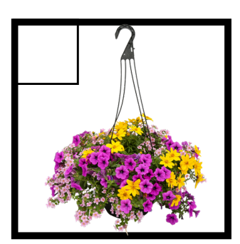
12° PREMIUM HANGING BASKETS A popular Spring selection! These hanging baskets, blooming with gorgeous flowers & trailing plants, are perfect for sunny spots. With beautiful varieties & mixes, they're here to add a special touch to your space!