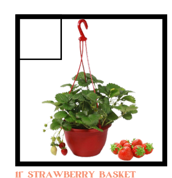
A treat for kids & strawberry lovers alike! Elevate snack time with homegrown strawberries all growing season long. With charming blossoms in white or pink, these everbearing varieties are as beautiful as they are delicious!