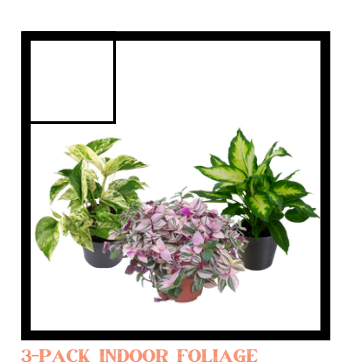
Add a tropical touch to your indoor space! Welcome the cascade of a trailing Pothos, a vibrant pop of color from a Tradescantia, & the elegant stature of a Dieffenbachia - all displayed in decorative pots! DUPLICATES & SUBSTITUTES MAY OCCUR.