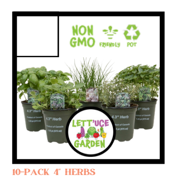
Elevate your dishes with a flavorful assortment of our finest herbs! Varieties may include: Basil (Sweet & Thai), Thyme, Chives (Onion & Garlic), Mint (Mojito & Peppermint), Oregano, Parsley, & Rosemary.