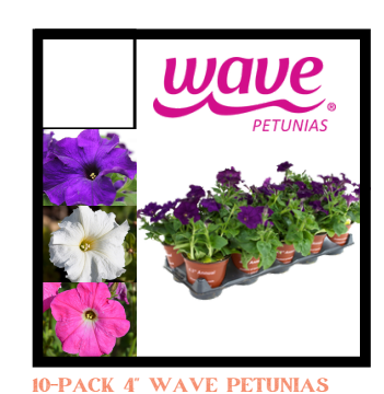
Paint your own outdoor canvas! Our cascading Wave Petunias, available in purple, white, or pink, will set the tone and elevate your garden, planter boxes, and hanging baskets. Don't miss out!